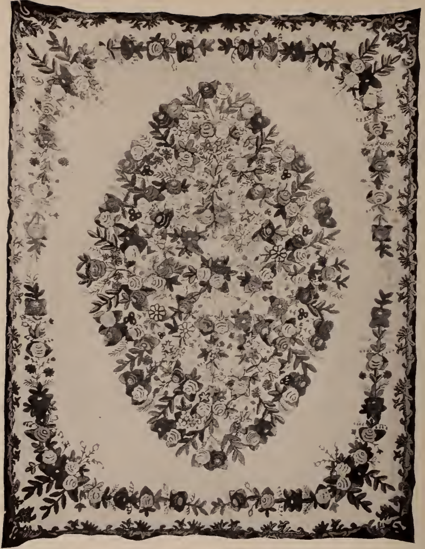
FLORAL HOOKED CARPET [NUMBER 100]